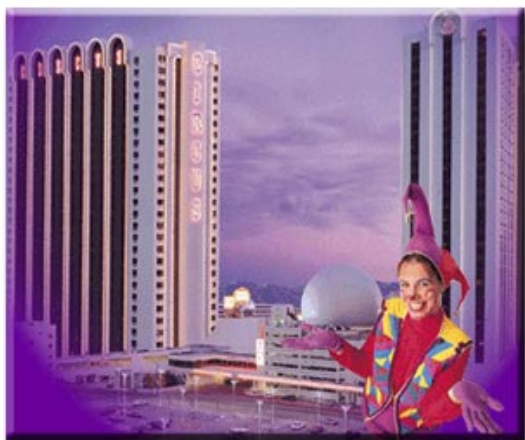
Circus Circus Reno